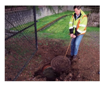
3: Inspect infrastructure and repair as needed.

1: Use a lid puller to remove the manhole lid.